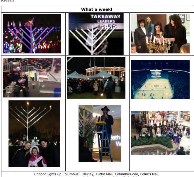
Chabad lights up Columbus – Bexley, Blue Mall, Columbus Zoo, Polaris Mall, Easton Town Center, Columbus Tuttle Jackets, Chabad Center

December 24 was our 4th annual Kosher Chinese dinner, with a delicious Chinese buffet and musical entertainment.